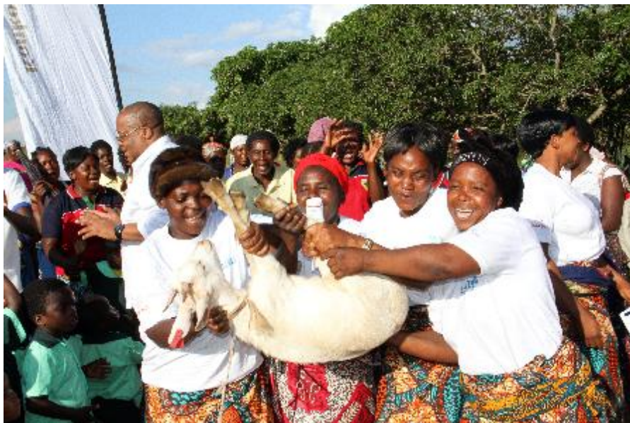
Nampundwe women receive the KCM livestock gift

"Livestock is considered a great asset as it represents personal wealth. As we share these goats and chickens with the farmers, we are giving them wealth which can subsequently be passed on to