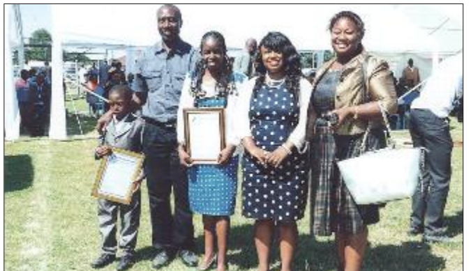
Nkana Refinery employees join the celebrations