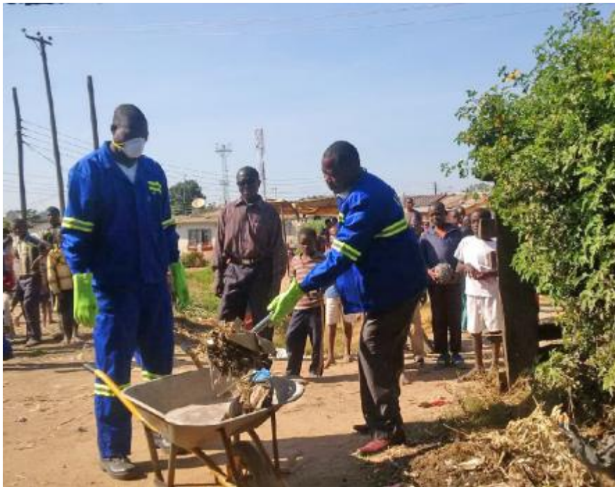
His Worship the Mayor of Chingola showing the community how the cleaning is done

To mark World Environment Day, KCM and the Chingola City Council recently launched a cleaning campaign at Banda Market in Nchanga Ward.