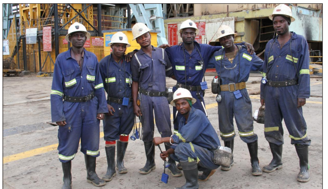
NUG 2100level operations crew pose for a photo after the day's shift