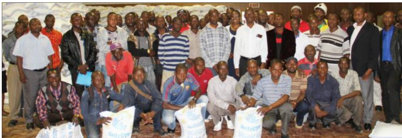
Konkola employees receive mealie meal for meeting production targets