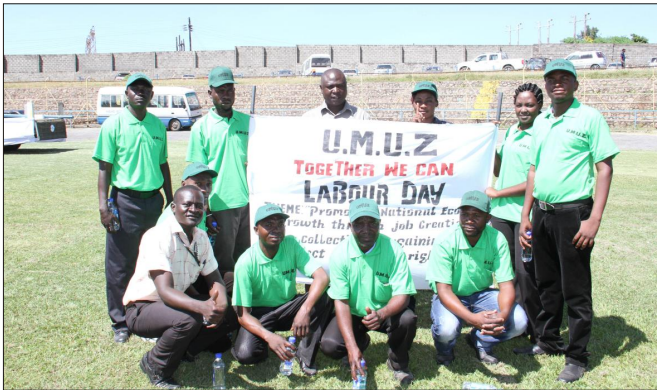
UMUZ Nchanga members