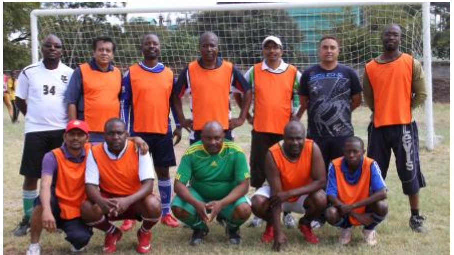
Smelter Management football team

Final results: Smelter Management 4 Nkana Refinery Management 5. Smelter Employees 2 Nkana Refinery Employees 1.