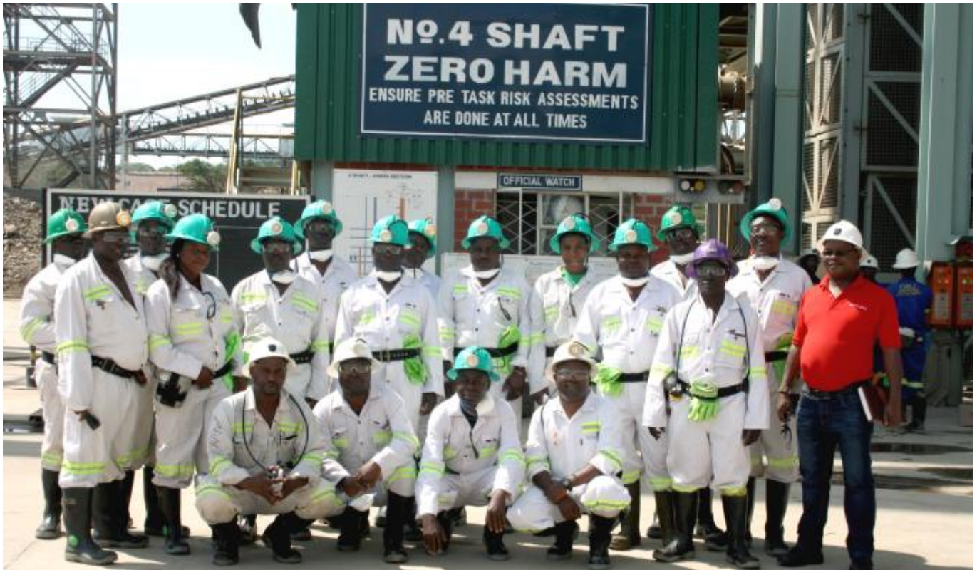
Chingola DJOC at No.4 Shaft when they toured the operation