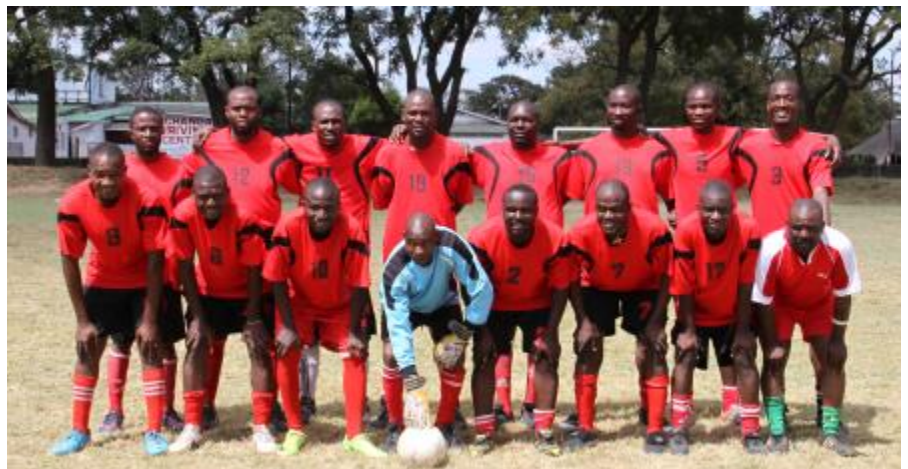
Nkana Refinery employees team