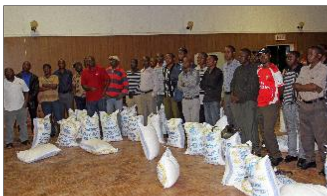
Happy to receive the bonus