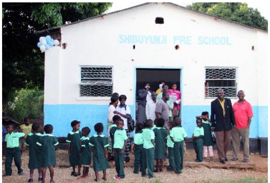
Some of the teachers and pupils at Shibuyunji Pre-school

A total of 1,179 children were enrolled at the 26 KCM supported rural pre-schools in Nampundwe.