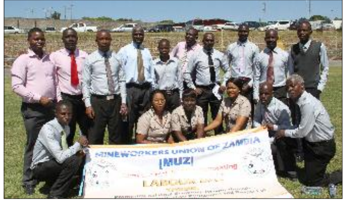
Nchanga MUZ members celebrate Labour Day