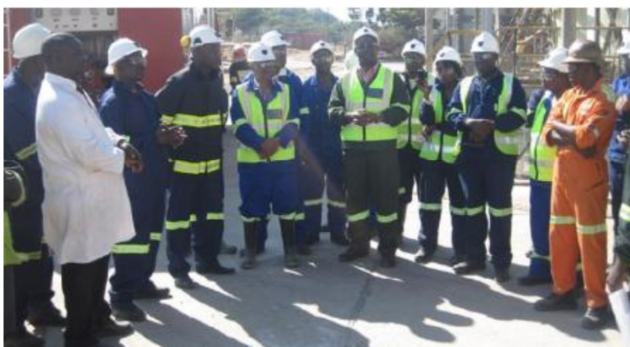
Mr Kapai addressing employees during the launch