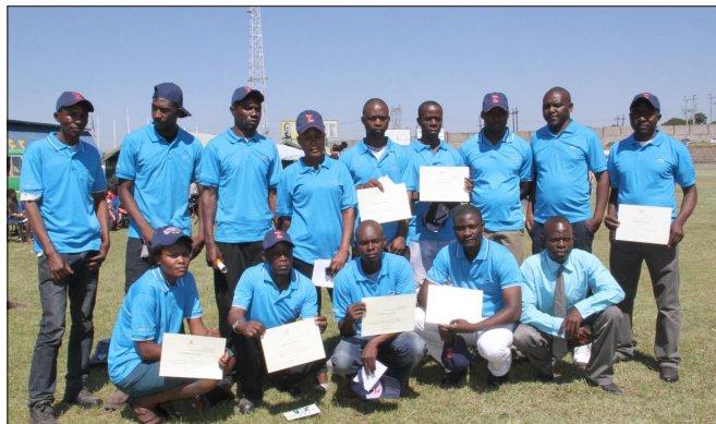
AMSL employees join the labour day celebrations