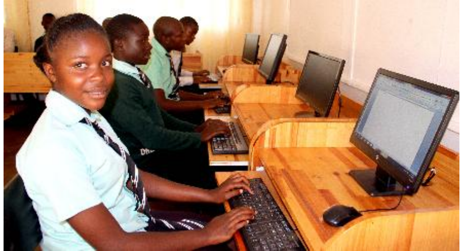
Twafwane school pupils using computers on the donated furniture