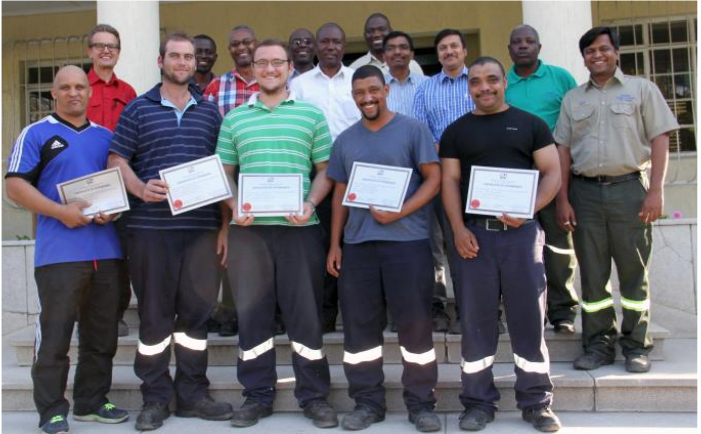
Front row: Cristal Global - Saudi Arabia trainees show off their certificates after a 10-day training at Nchanga Smelter