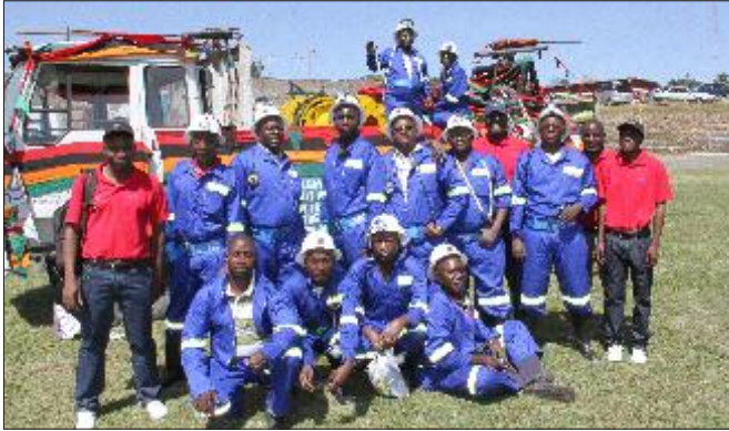
Nchanga employees on Labour Day