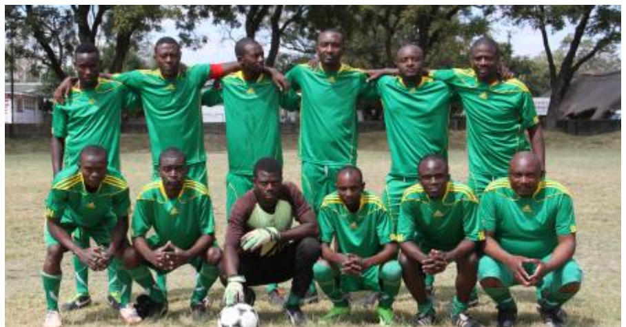
Smelter employees football team