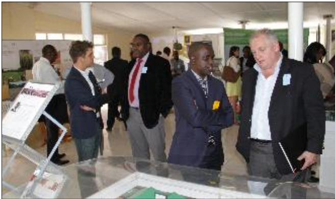
KCM team at the Zaminex show in Kitwe