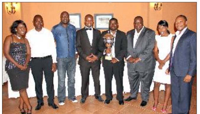
KCM officials at the 2014 Chingola Chamber awards gala