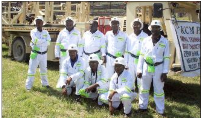
Konkola Mine Training School team