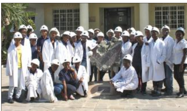
Roma Girls Secondary School visit to KCM