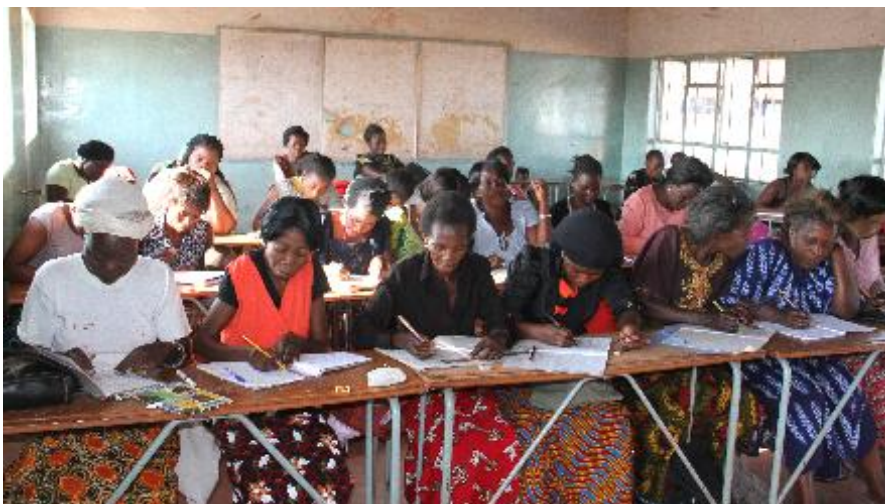
An Adult Literacy class in progress

"It is good that the Ministry of Education has allowed the learners to sit for grade seven exams. There is a glimmer of hope for those who never had a chance to attain this level of education."