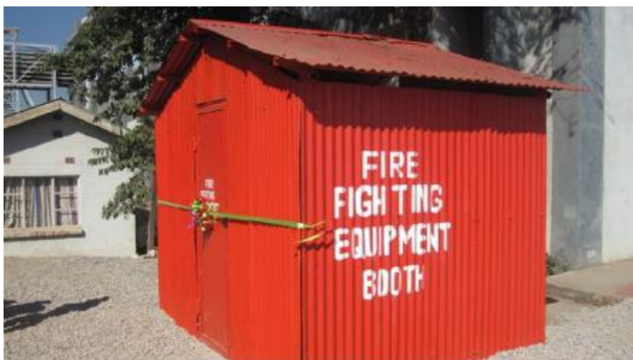
Fire fighting equipment booth in Konkola