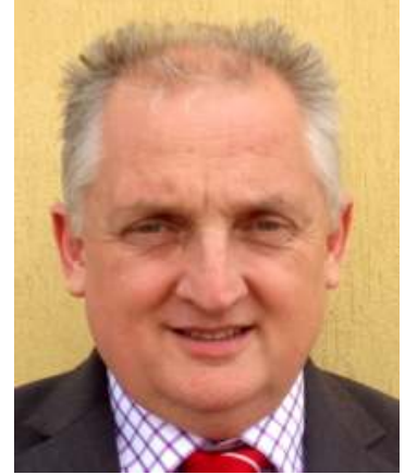
Paterson - VP Local Economic Development