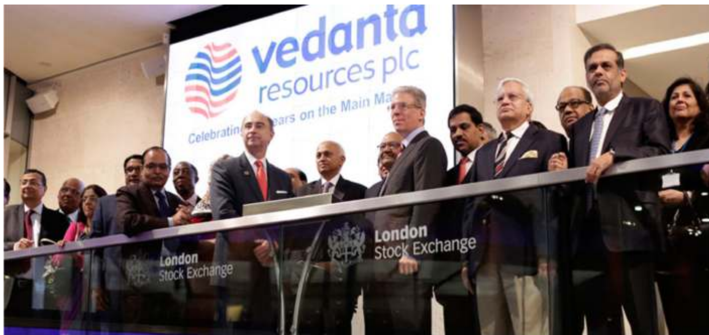
Chairman Anil Agarwal (7th from right) with Albanese on his left during the memorable Vedanta event in London

We have created the foundations to enable us to continue mining in Zambia for at least the next fifty years.