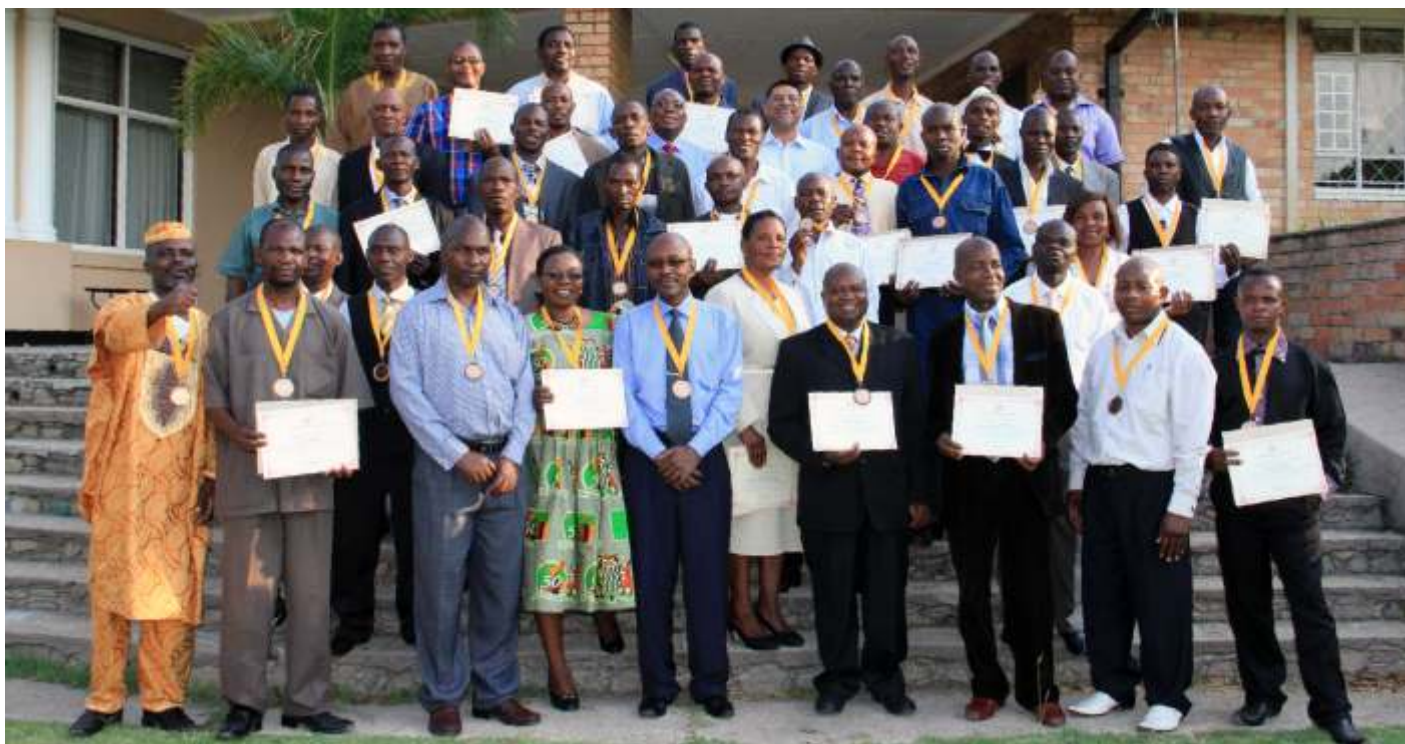
Recipients of awards for the 50 year olds