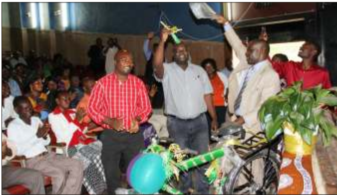
It's all cheers!