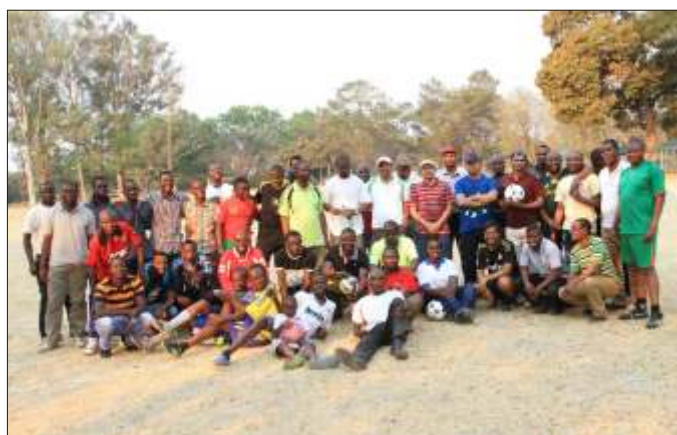
One Team, One KCM!