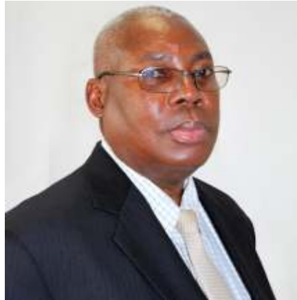
Njovu - VP HCM

Current production levels are insufficient to address our financial losses so please discuss with your line managers and colleagues how we can improve volumes which are your control