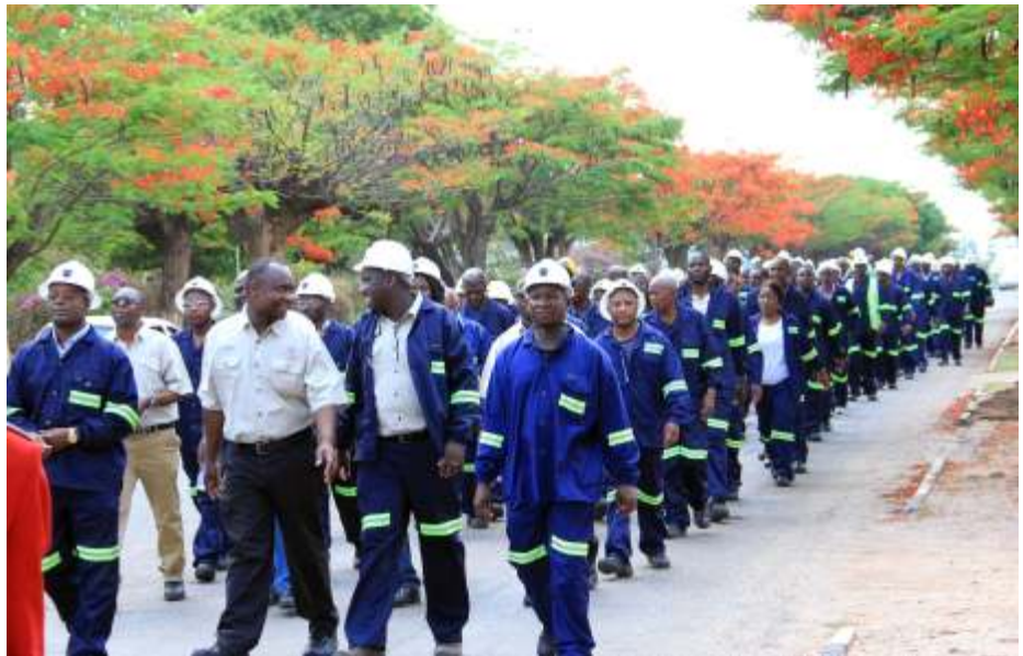
Employees march in Konkola to highlight the safety initiative

The Chachilamo Initiative is both a reminder of the importance of safety and a practical initiative to ensure that all employees can feel safe at work.