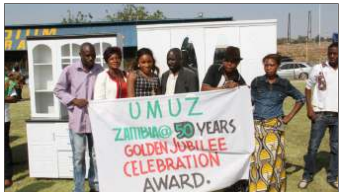
UMUZ members toast at Nchanga Stadium