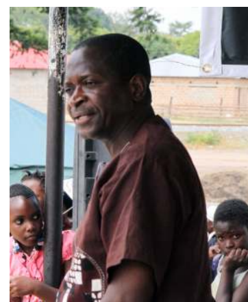
Chingola DC Nang'alelwa