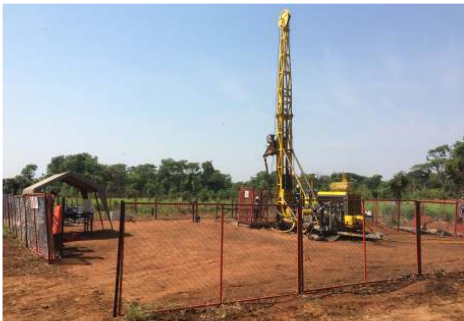
A Surface Diamond Drilling Rig in Operation

KCM geologists and consultants have completed Phase I exploration activities at Springfield in Southern Province. The exploration programme proved the existence of coal, which is deemed to have qualities that can support power generation onsite.