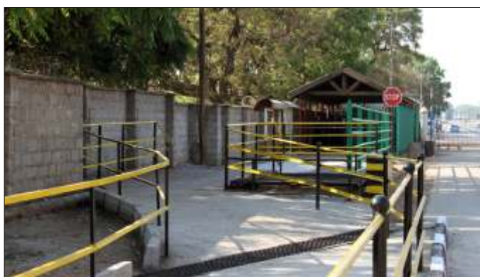
A rehabilitated walk way at the Kitwe Road Gate. Mine Training School has started to rehabilitate walkways as part of measures to improve safety in KCM