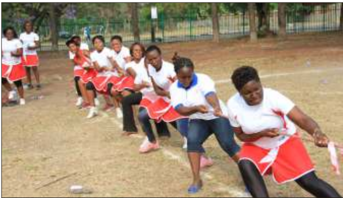
KCM women having a go at Tug of War