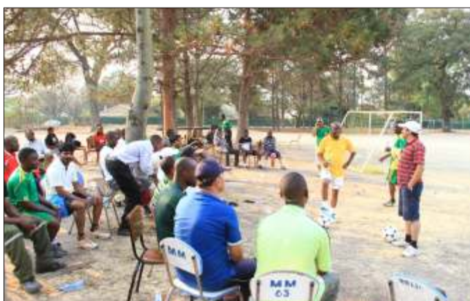
Employees relax during Inter-IBU games