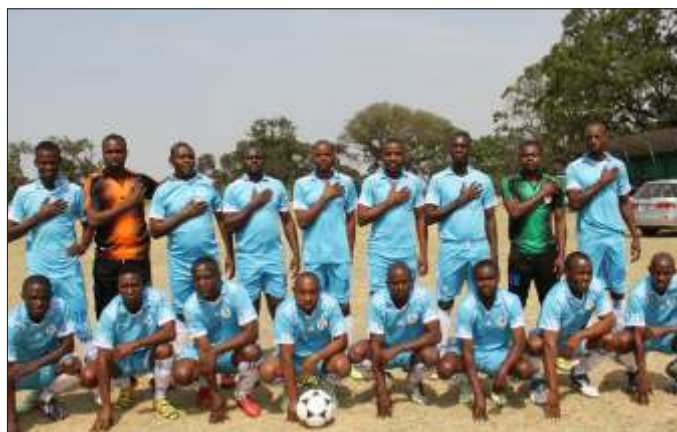
The AMSL Team