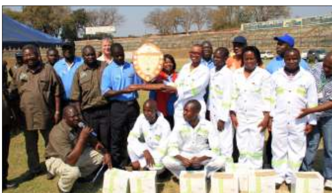
The Konkola Security Team display their shield