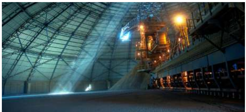
Skorpion Zinc Refinery Stacker

Approximately $630 million of the $782 million approved will go towards developing the open-pit zinc mine, concentrator plant and associated infrastructure at South Africa's Gamsberg, one of the world's largest undeveloped zinc deposits. The balance of the investment will be used to convert the refinery at Skorpion Zinc in