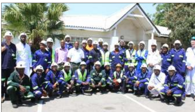
Above (left & right) Shift bosses from Konkola during familiarisation of processing plants at Nchanga pose for photos at Central Training