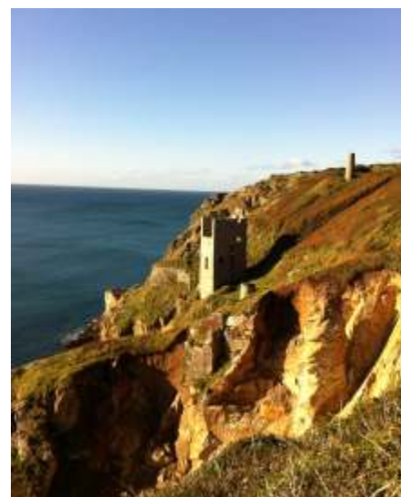
The old Cornish tin mines

I want to see KCM reaching its potential, working safely, reaching targets and making profits, and to see people taking pride in their work and feel proud to be part of KCM and Vedanta. I would also like to see the facilities at Chilibabombwe restored to their former glory, rehabilitating the sports clubs, encouraging the younger generation to play sports. My aim is to play a game of tennis on the old derelict grass tennis courts under flood lights.