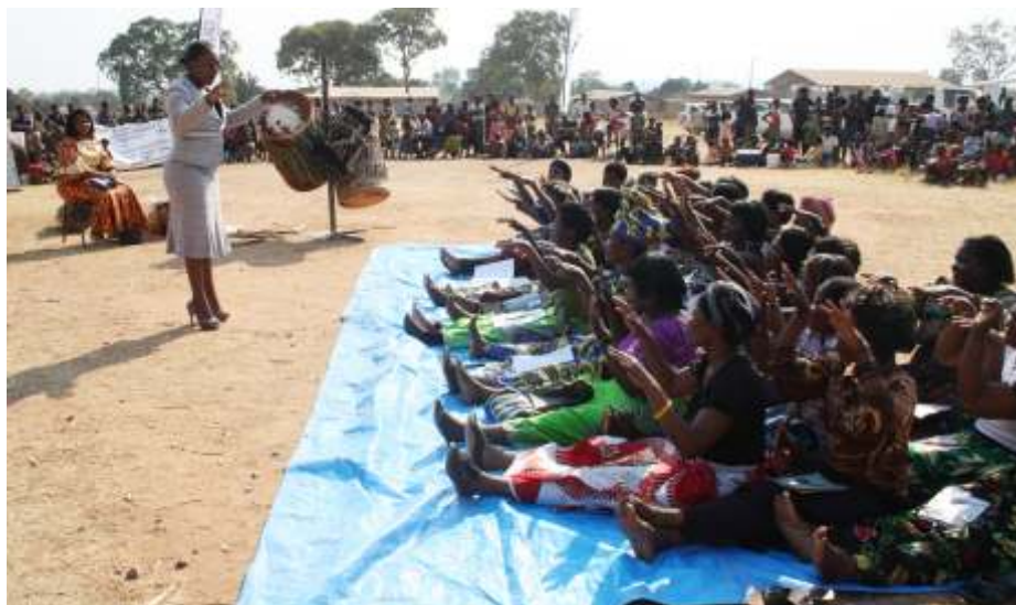
An adult literacy class underway in Chililabombwe

"I am particularly happy because this programme has enabled the learners to be able to read and