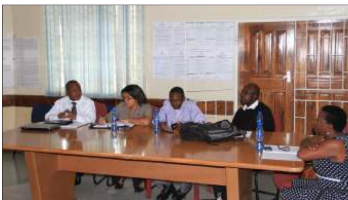
Above the SAP Team during the road show for new products at Nchanga underground