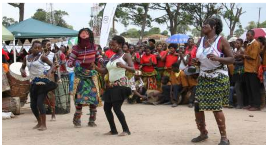
Wriggling waists the Northwestern style: dancers perform in Chiwempala in Chingola