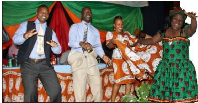
Dance! Dance! Dance!