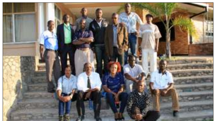
Numaw members at Nchanga golf Club