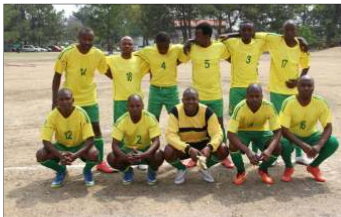
The SHE Team