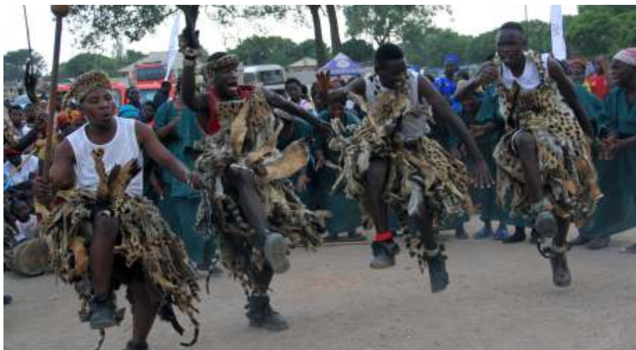
Ncwala dancers entertain people during the KCM cultural festival

KCM supports 36 cultural groups and has sponsored 30 youths to participate at national events and equipped them with life-supporting skills.