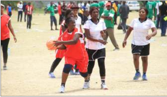
Netball games in session during Inter-Departmental games!